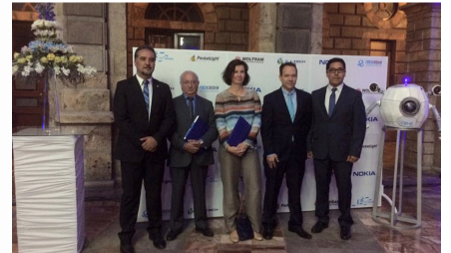
Celebración de los 15 años de RedCEDIA.

According to Cadenas, the visits yield many other beneficios, even if intangible. "The most important thing is that we have been able to structure a vision that seeks to find the set of interests of the networks and that becomes much easier if we are close to them. Although we have access to videoconferences and other collaboration tools, nothing replaces a personal encounter".